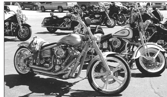
Join the Kilowatt to Kill Cancer Relay for Life team on a scenic ride to raise funds for the American Cancer Society. This year's ride is scheduled for Sept. 11.